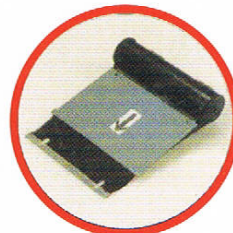
9016-11 (B) EXCLUSIVE REPLACEABLE RIBBON CARTRIDGE