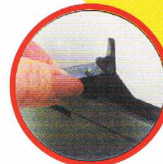
CUSTOMIZED SLIDING PREFIX PLATE