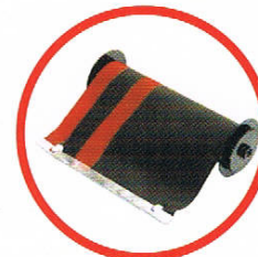
8000-10 (B/R) EXCLUSIVE REPLACEABLE RIBBON CARTRIDGE