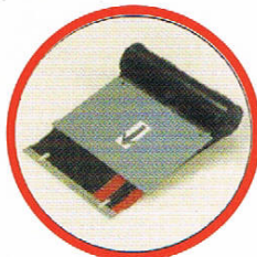
9009-9 (B/R) EXCLUSIVE REPLACEABLE RIBBON CARTRIDGE